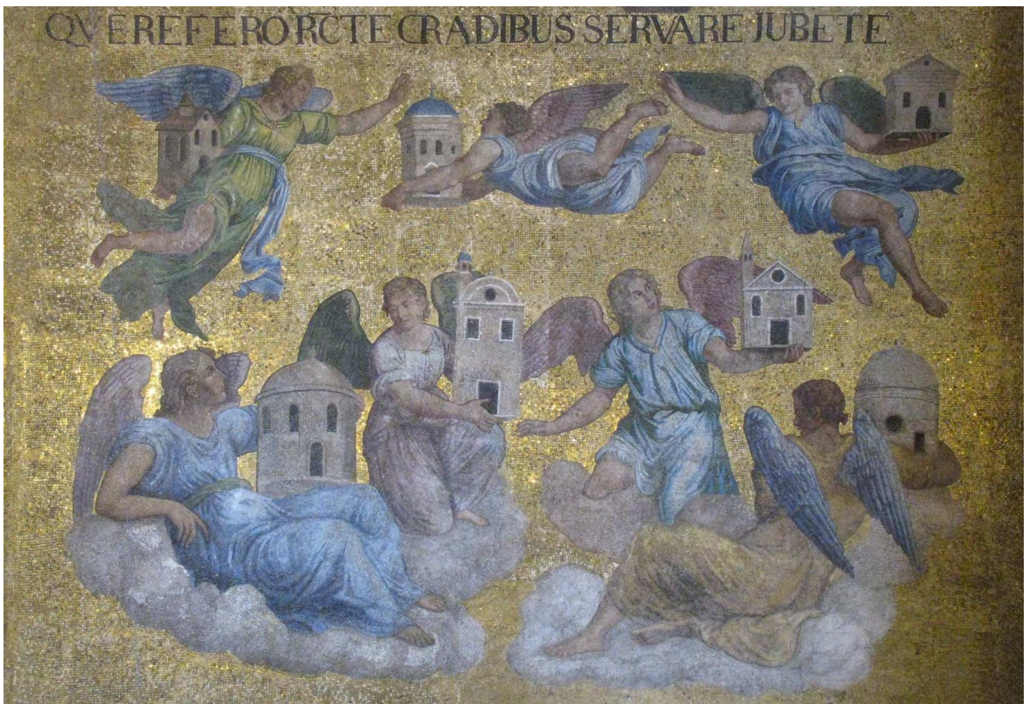
Figure 1: Mosaic of the Seven Angels St. Mark's Basilica Venice, Italy

Outline Reference: John Stott, What Christ Thinks of the Church: An Exposition of Revelation 1-3 , Baker, 2003.